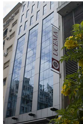
UCEMA building of Reconquista 775, located in downtown Buenos Aires, at the heart of the financial and cultural activity of the country