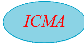
International Commission on the Middle Atmosphere