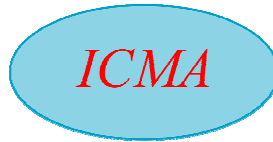
International Commission on the Middle Atmosphere