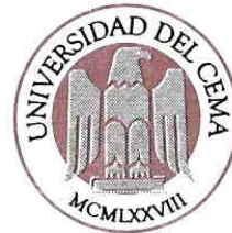
UCEMA Universidad del Centro de Estudios Macroeconómicos de Argentina