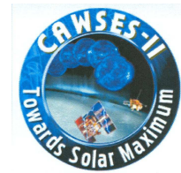
Climate and Weather in the Sun-Earth System