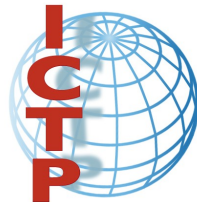
International Centre for Theoretical Physics