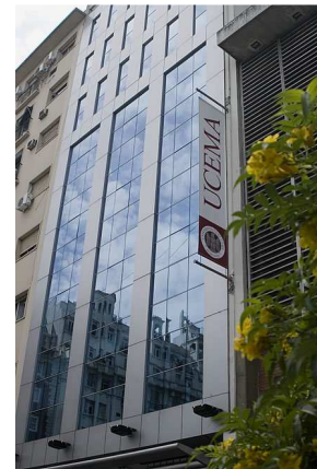
UCEMA building of Reconquista 775, located in downtown Buenos Aires, at the heart of the financial and cultural activity of the country